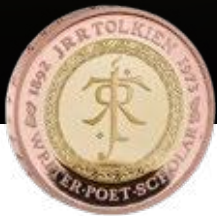
Celebrating the Life and Work of JRR Tolkien 2023 UK £2 GOLD PROOF COIN