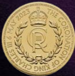
The Coronation of His Majesty King Charles III 2023 1oz GOLD BULLION COIN

official crowned coinage portrait of The King, exclusively designed by Martin Jennings for The Royal Mint and only available as part of our Coronation UK Coin Collection.