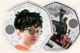
Harry Potter COIN SERIES

The British Monarchs Collection uniquely celebrates iconic kings and queens by providing a numismatic snapshot of their respective reigns through coin designs of yesteryear.