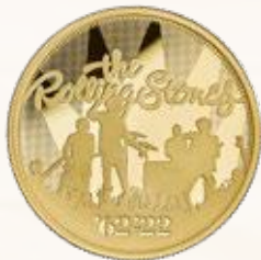
The Rolling Stones 2022 UK 1oz GOLD PROOF COIN

after 31 December 2023, so don't miss your chance of owning a coin that celebrates 'The Greatest Rock 'n' Roll Band in the World'.