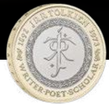
Celebrating the Life and Work of JRR Tolkien 2023 UK £2 BRILLIANT UNCIRCULATED COIN

Code: UK23JTSP LEP: 4,500 Price: £77.50 MCM: 5,160