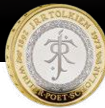
Celebrating the Life and Work of JRR Tolkien 2023 UK £2 SILVER PROOF COIN

Code: UK23JTGF LEP: 2,000 Price: £127.50 MCM: 2,410