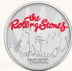
The Rolling Stones 2022 UK £5 BRILLIANT UNCIRCULATED COLOUR COIN

Code: UK22RS1S LEP: 8,000 Price: £107.50 MCM: 8,010