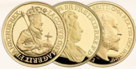
British Monarchs COIN SERIES

The British Monarchs Collection uniquely celebrates iconic kings and queens by providing a numismatic snapshot of their respective reigns through coin designs of yesteryear.