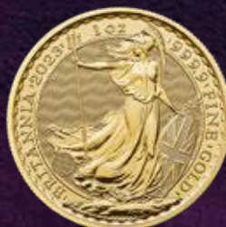
The Coronation Britannia 2023 1oz GOLD BULLION COIN

Code: BKCC23G1 Price: From £1,660.69* MCM: 7,500