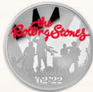
The Rolling Stones 2022 UK 1oz SILVER PROOF COLOUR COIN

Code: UK22RS1GP LEP: 350 Price: £2,770.00 MCM: 360