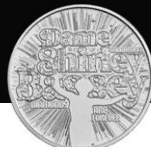
Dame Shirley Bassey 2023 UK 1oz GOLD PROOF COIN