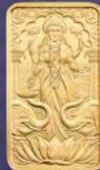
Lakshmi 20g GOLD BULLION MINTED BAR

Code: HG002G20L | Price From: £1,099.73*