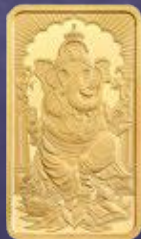
Ganesh 20g GOLD BULLION MINTED BAR

Code: HG002G20L | Price From: £1,099.73*