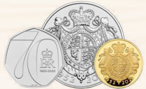
The Platinum Jubilee of Her Majesty The Queen COIN SERIES

Struck to celebrate the 25th anniversary of the publication of Harry Potter and the Philosopher's Stone , this four-coin collection features coinage portraits of Queen Elizabeth II and King Charles III.