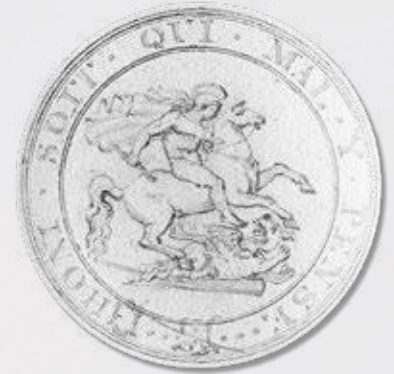
Benedetto Pistrucci's St George and the dragon design

The accessions and successions of monarchs is only one of many stories that coins can tell. The introduction of new denominations holds a wealth of information too, such as our flagship coin, The Sovereign. First introduced during the reign of Henry VII, the king chose the name 'Sovereign' for his 'new money of gold' to establish the legitimacy and authority of the new Tudor dynasty. The Sovereign was replaced during the reign of James I by another gold coin and was then reintroduced during the reign of George III, when the need arose for a coin with a value of 20 shillings.