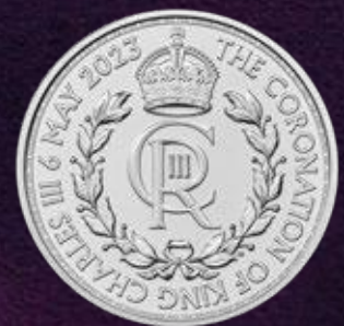
The Coronation of His Majesty King Charles III 2023 1oz SILVER BULLION COIN

Code: UKB23CBG1 Price: From £1,660.69* MCM: 10,000