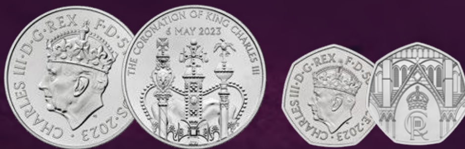
The Coronation of His Majesty King Charles III 2023 UK £5 BRILLIANT UNCIRCULATED COIN

In addition to featuring the crowned coinage portrait, the 2023 Coronation Sovereign is also notable as it is the first Sovereign of King Charles III's reign to feature Pistrucci's iconic St George and the dragon design. With so many firsts associated with this release, it is a coin that numismatists and collectors will appreciate today, tomorrow and for many years to come.