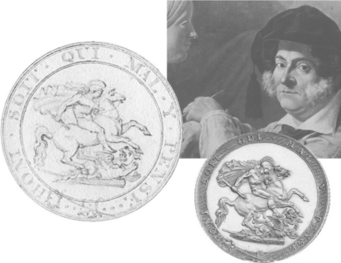
An original drawing by Pistrucci and a gold Sovereign showing the St George and the dragon design.

Benedetto Pistrucci was born in Rome in 1783 and built up a considerable reputation as a gem engraver. He was in France during the last few days of the Napoleonic regime and decided to come to England shortly after the Battle of Waterloo. He was commissioned to provide portrait models of George III for new gold and silver coinage, which were then cut directly into steel by The Royal Mint’s engravers to make the coin dies. Pistrucci, however, was unhappy with the result and decided he would master the technique of engraving himself. The new crown piece of 1818 which bore the St George design was described as ‘the handsomest coin in Europe’. As a foreigner Pistrucci could not be appointed to the post of Chief Engraver but he did stay on at the mint to become Chief Medallist in 1828, a post which was created especially for him. He died at Englefield Green, near Windsor, in 1855.