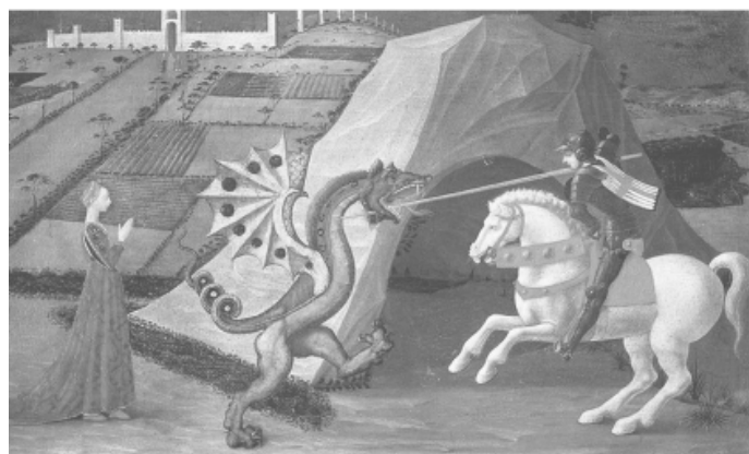
St George and the Dragon by Paolo Uccello

At that moment, the hungry dragon appeared from the lake and attacked St George. St George was quick and using his Christian cross and lance he pinned the dragon to the ground. The princess took the belt from her dress and made a collar and lead for the dragon, which she put around its neck so that it became timid and tame. St George then took the princess back to the city and slayed the dragon. The king was so impressed by St George's bravery that he was baptised a Christian, and the people of Silene lived in peace once more.