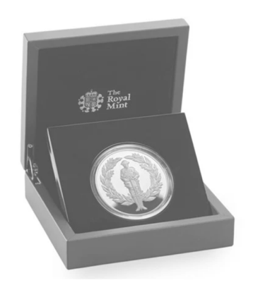
The First World War Centenary